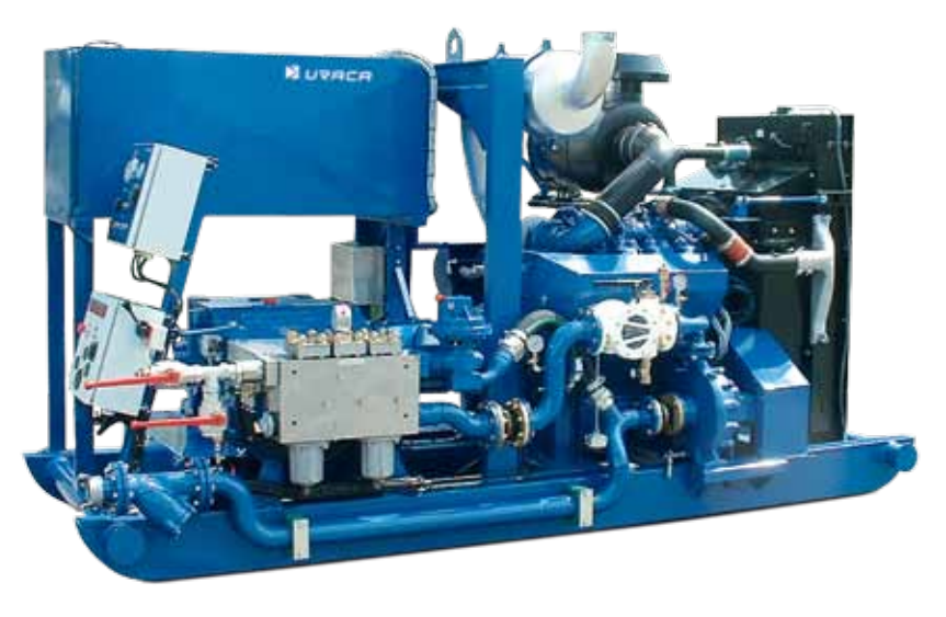
Diesel driven test pump unit DP725 D. Compact design with back flushing filter