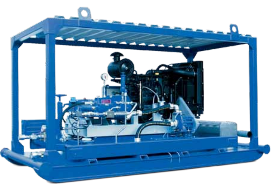
Test pump unit DP719 D/250 with sunshield and special base frame to be used on weak and sandy underground.

Electrically or diesel driven test pump units with an ideal power range – also available as a skid version.