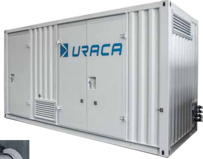
Test pump unit DP724 E for cyclic pressure testing in container design.

Electrically or diesel driven test pump units for flexible and efficient testing applications – even under extreme conditions.