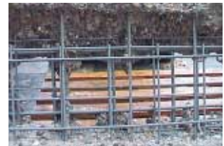
Concrete resurfacing and demolition with the URACA Vario Jet. The impressive demolition depth in hard concrete and the careful and efficient exposure of the reinforcement speaks for itself.