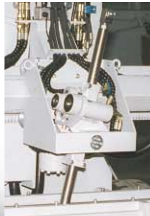
Tool holding fixture.

URACA Pumpenfabrik GmbH & Co. KG Sirchinger Straße 15 D-72574 Bad Urach, Germany Phone +49 (71 25) 133-0 Fax +49 (71 25) 133-202 info@uraca.de www.uraca.de