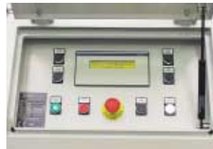
Control panel with display.